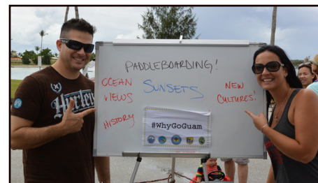
POLARIS POINT, GUAM (Dec. 19, 2015) Sailors and families share reasons to "Go Guam" by using the hashtag #WhyGoGuam at Team 15 Day, a Submarine Squadron 15-sponsored event that brings together Sailors and families from the submarine community on Guam to educate them on Navy support services and acclimate new arrivals to life on Guam.